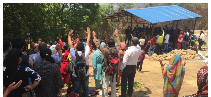
Nepalis marking anniversary of the 2015 earthquake with prayer

"Blessed are those whose strength is in you, whose hearts are set on pilgrimage." (Psalm 84.5)