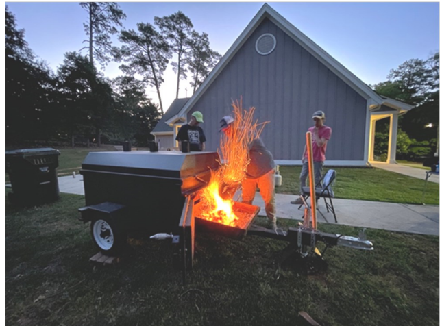
Cooking started early as the chefs enjoyed the sunrise