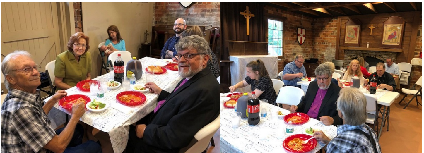
Reception and Dinner at St Andrew's